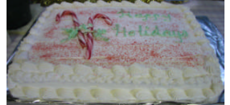
A grand time was had by all in attendance.